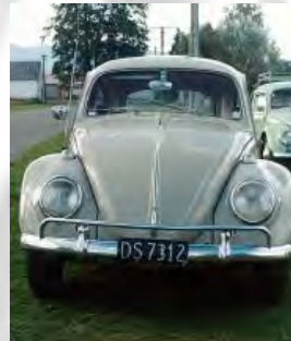
1966 Aussie ass 1300 56,000 miles & 1960 Beryl Green Beetle in Background