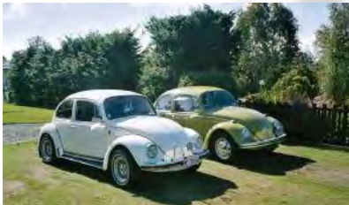
1970 1500 Beetle & 1600 Fuel In-jected German assy Beetle

It is great to be members of the Canterbury VW Club and meet other members also passionate about their Volkswagens. We had a truly amazing time on the Anniversary Kombi tour and met some lovely people.